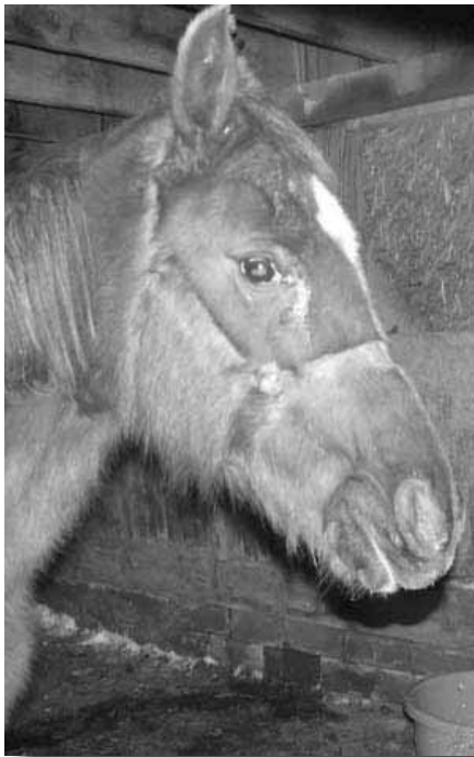
ABOVE: Mariposa Halter photo When the embedded halter was removed from Mariposa, hide and flesh came off with it.