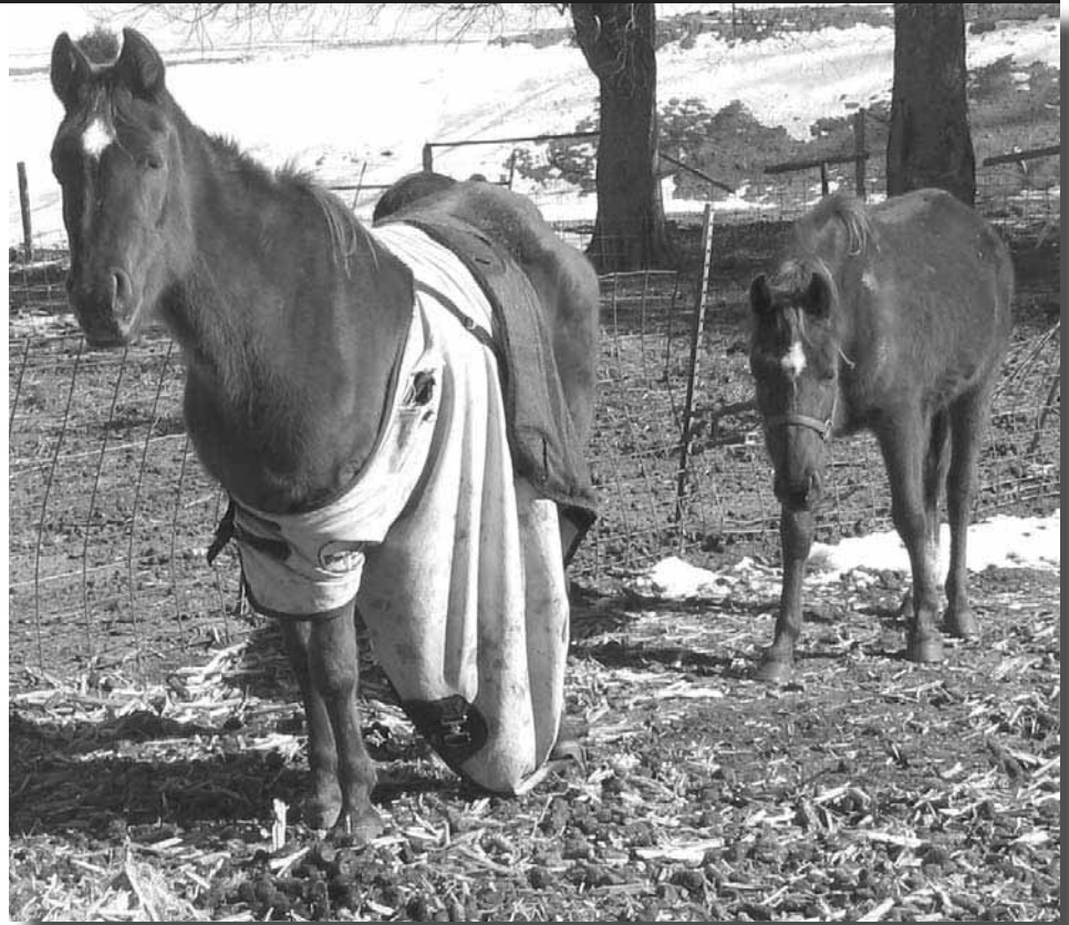
ABOVE: Hermosa and Mariposa when first discovered on the Iowa farmstead.

We discovered that the previous neglectful owner had pronounced Hermosa "dead on February 15 th , 2008." IERAL had to prove to AHA that Hermosa was ALIVE by pulling DNA and sending it