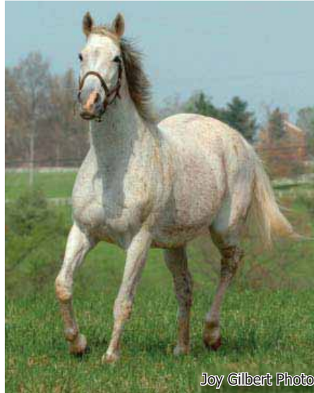
"Fine Stitches" enjoys a romp at the KyEHC