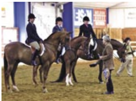
A Hunt Seat Class portion of an Arabian Show in the climate-controlled indoor arena of the IEC