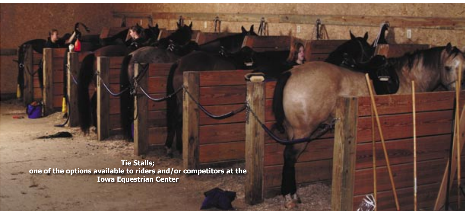
Tie Stalls; one of the options available to riders and/or competitors at the Iowa Equestrian Center