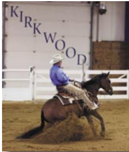
Reining - A popular spectator sport at the IEC

"Having the classrooms right next to our stalls and stables is really practical. When we are in class discussing anatomy or other topics, all we have to do is walk out