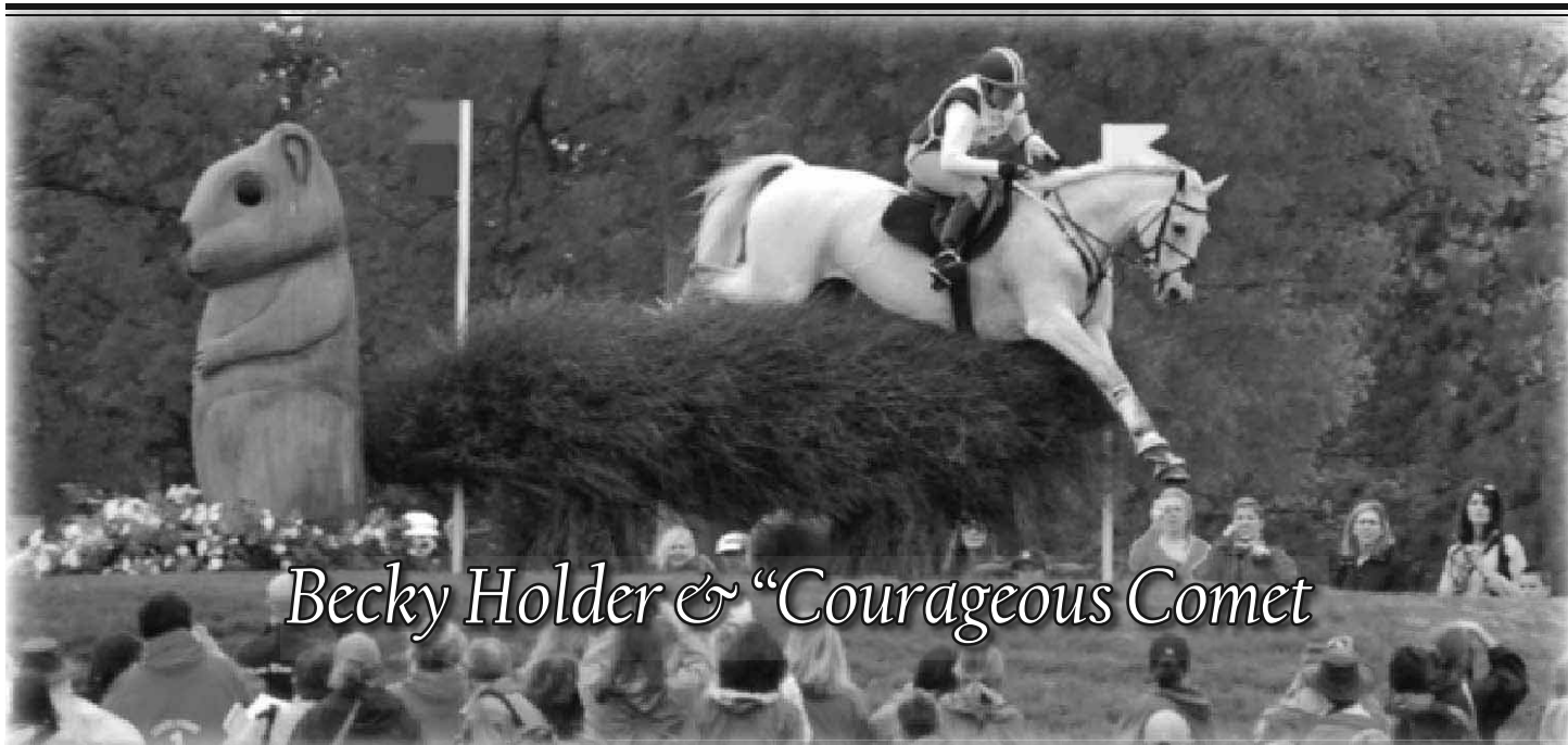
Becky Holder & "Courageous Comet"

And may next year's Rolex be a year of complete success: No injury to horse or rider.