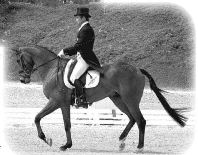
Phillip Dutton and "Connaught" showing their 'style'

the entire stadium was holding their breath when he got to the last jumps - and the EXPLOSION of the crowd when he went double clear (only one of two riders to do so) rocked the stadium and I am pretty sure registered on the Richter Scale in Kentucky! And to see his absolute joy in galloping the Victory Round belied the fact that he said, "Everyone else was more worried about my not winning a Four Star than I was."