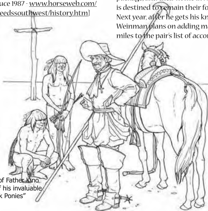
Drawing of Father Kino and one of his invaluable "Rock Ponies"